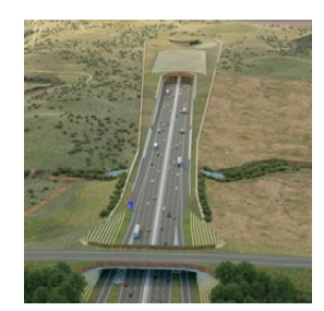
Graphical representation of the proposed Lower Thames Crossing.

We are disappointed to hear that the decision on planning permission for the Lower Thames Crossing has been delayed until