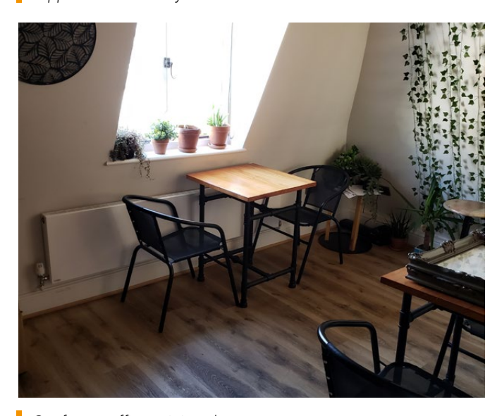
Our former office as it is today.