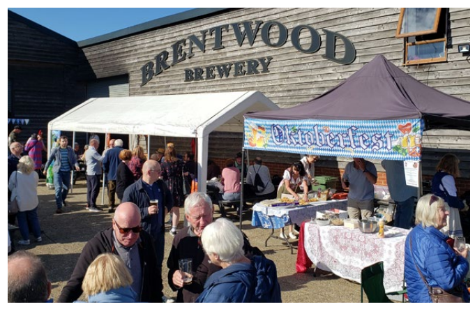
Octoberfest 2024 at Brentwood Brewery

After a week of rain, the sun shone for the whole day and well over one hundred people attended the event.