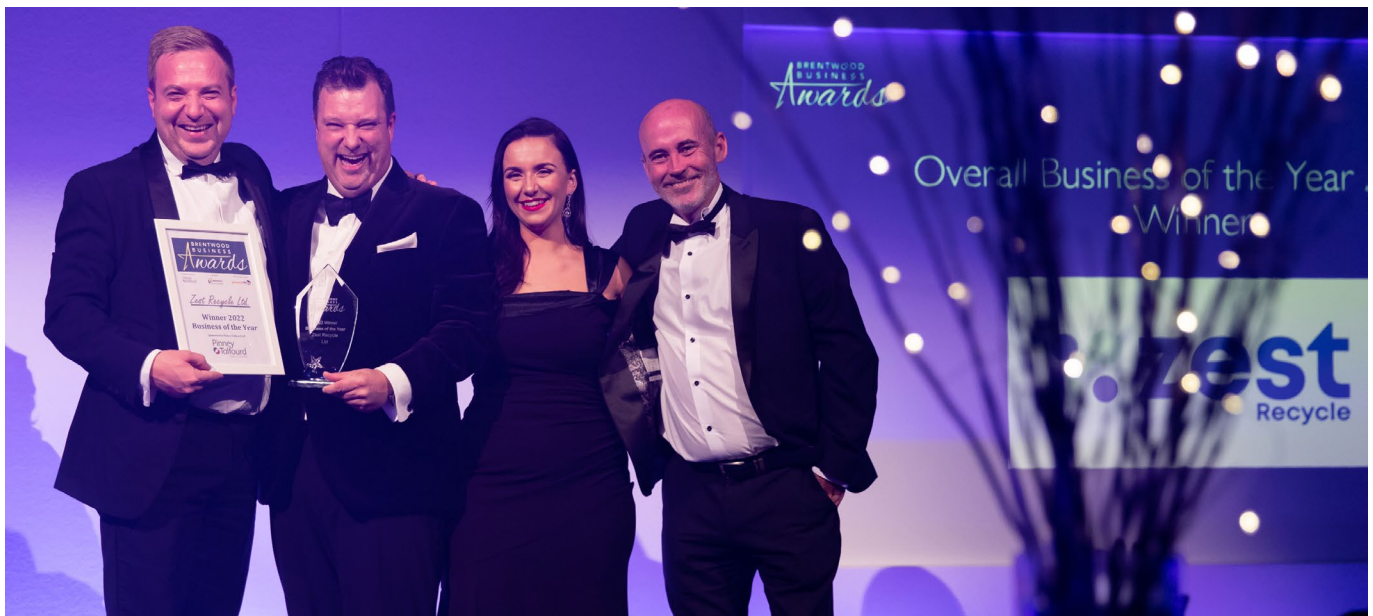
Brentwood Business of the Year 2022 - Zest Recycle