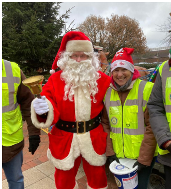
The Rotary Club of Brentwood collecting for local charities