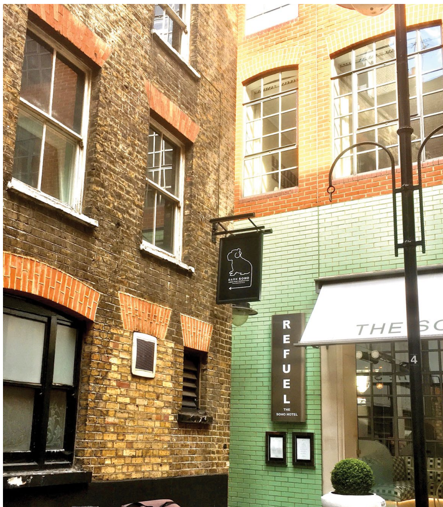
▮ WeBuildEssex were main contractors and project managers on this famous Soho building