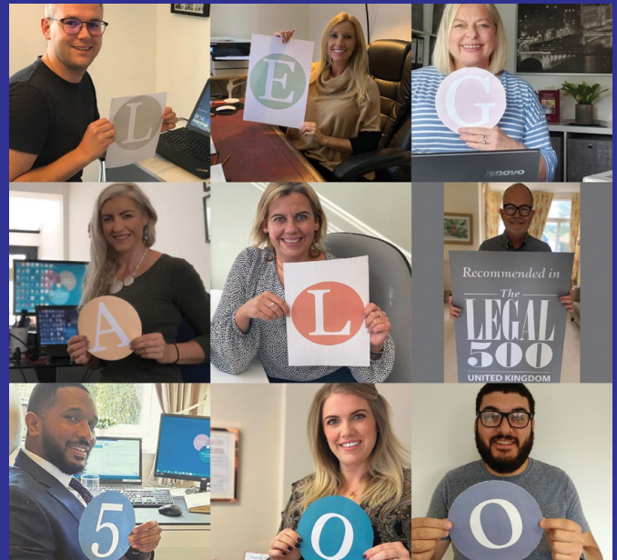
Members of the Fisher Jones Greenwood team celebrate their achievements