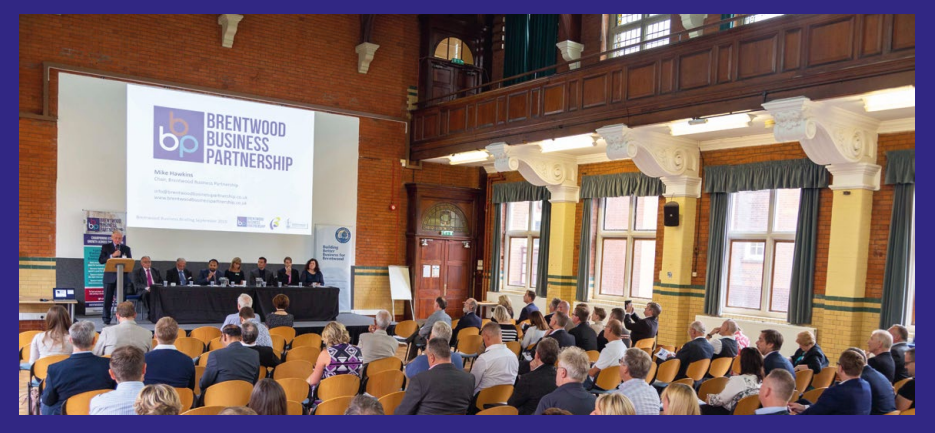
ACL Essex will again be the venue for the second Brentwood Business Briefing next month