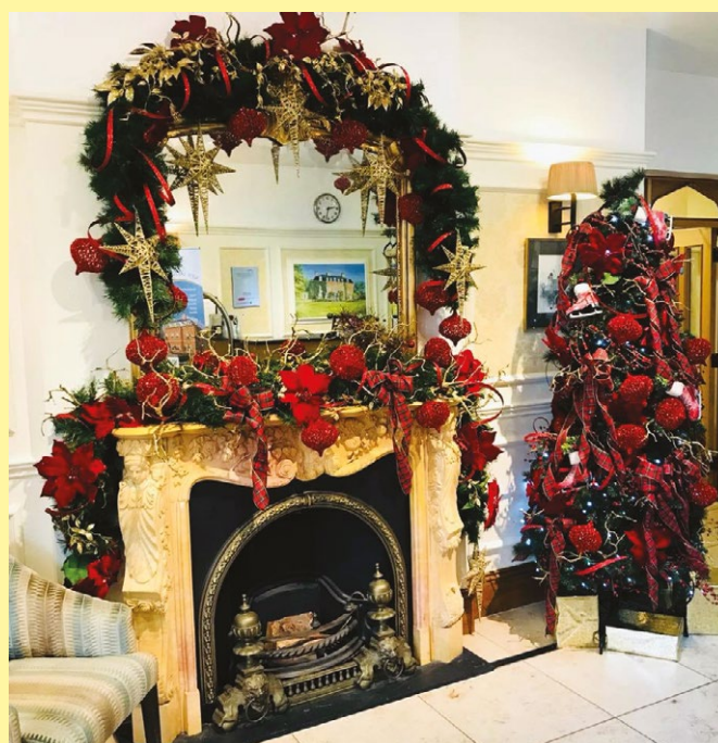
Orsett Hall Hotel will be fully decked out by November 21 for the annual Christmas Shopping Evening

It promises to be a great way to celebrate your 2018 successes and make new business connections for a prosperous 2019. We look forward to seeing as many of you there as possible! Book online now at brentwoodchambers.co.uk/events .